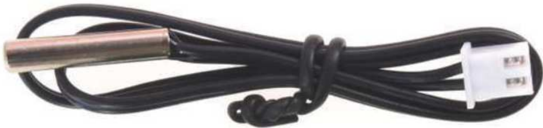
W1209 Temperature Control Switch