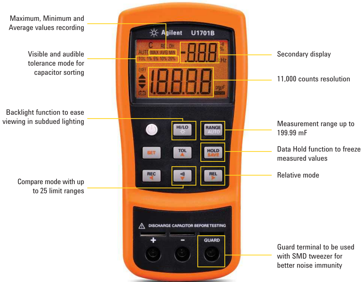
Figure 2. U1701B front view