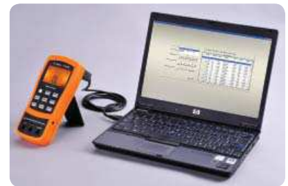
Figure 1. Automate the recording of continuous readings when you hook the U1701B to a PC

The handheld capacitance meter comes in a robust overmold and tested to stringent industrial standards. Each capacitance meter is also sealed with a three-year warranty and the assurance that you can test your components with confidence.