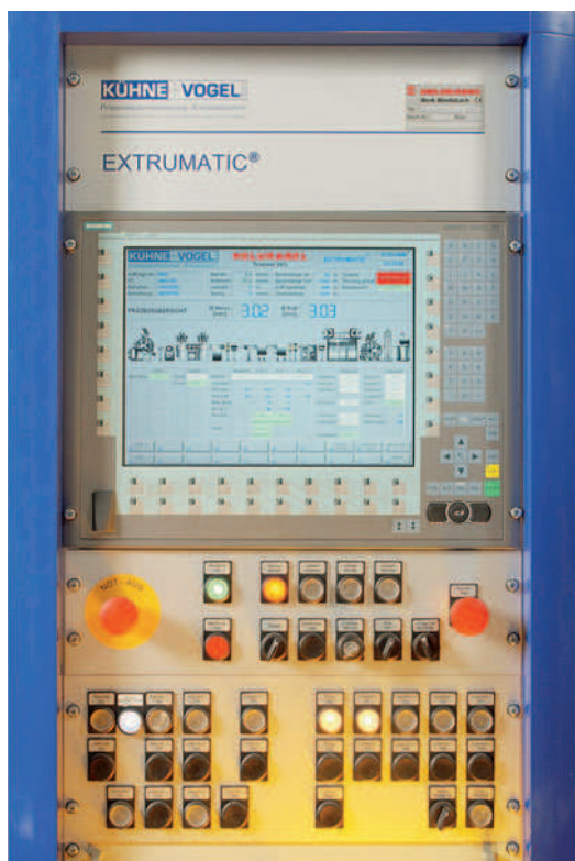
Standardised process control and visualisation of an extrusion system at our Windsbach factory.

Dimensions and specifications may be changed without prior notice. (RB01)