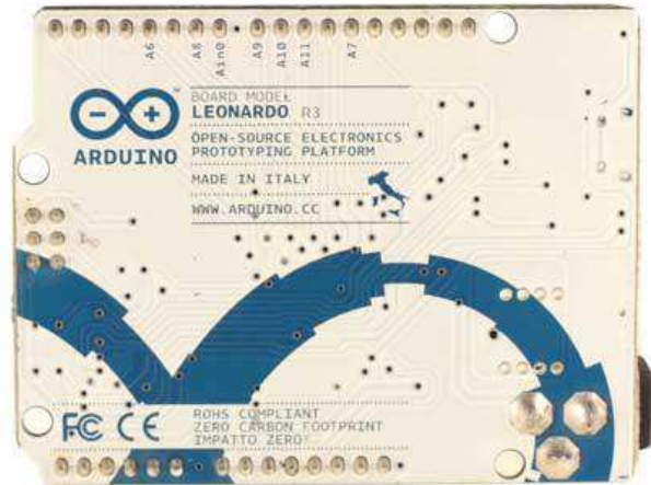
Arduino Leonardo Rear