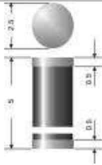
Surface mount diode