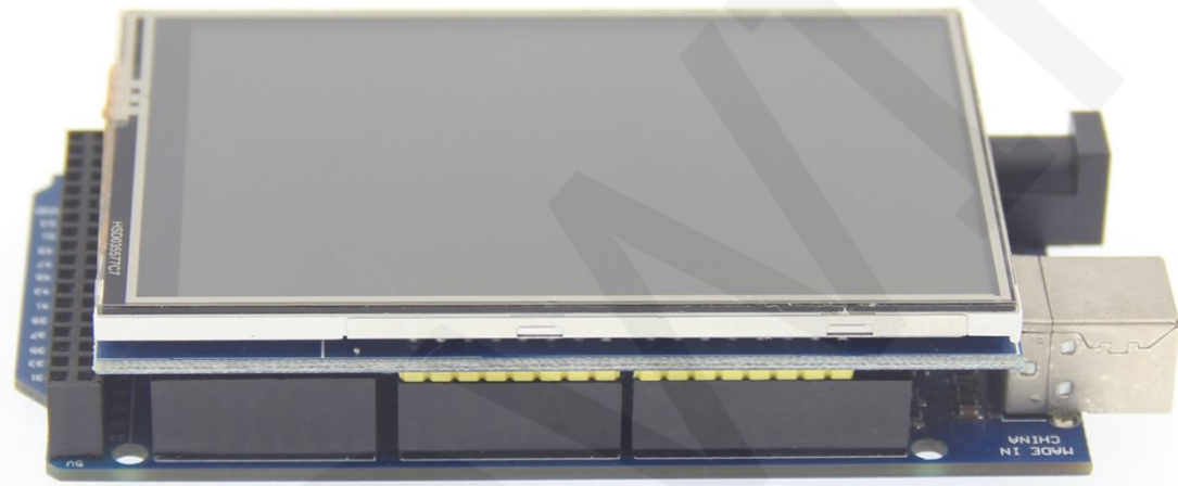
Mega2560 directly inserted picture