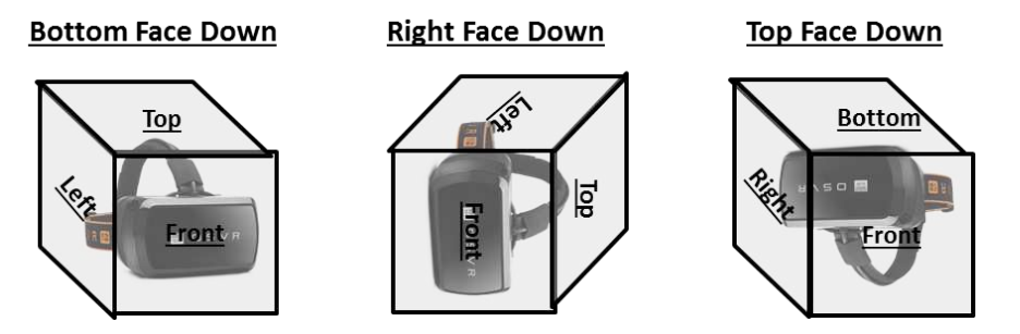
Figure 3: Headset Orientation Example

b. Orient the device so that it is sitting on each face of the cube sequentially. For example, start with the device positioned normally (bottom face of the cube down). Then orient it so that the right side of the cube is facing down. Then continue through the rest of the faces of the cube. See Figure 3 for an example.