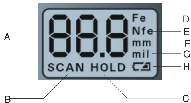
ILLUSTRATION OF DISPLAY SCREEN