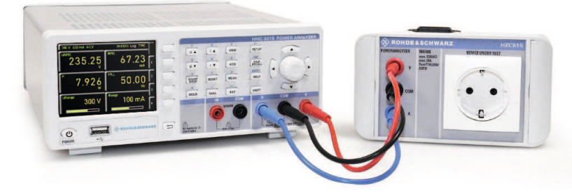
R&S®HMC8015 power analyzer with the HZC815 adapter.