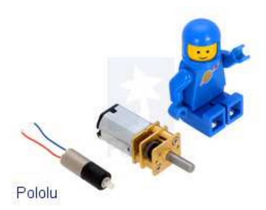
26:1 sub-micro plastic planetary gearmotor next to a micro metal gearmotor and a LEGO Minifigure for size reference.

26:1 Sub-Micro Plastic Planetary Gearmotor 6Dx16L mm