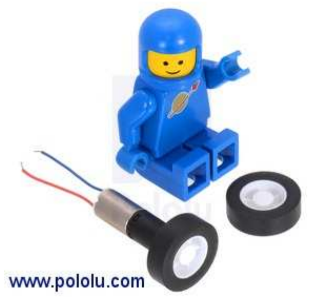
14×4.5mm wheel pair with a sub-micro plastic planetary gearmotor and LEGO Minifigure for size reference.